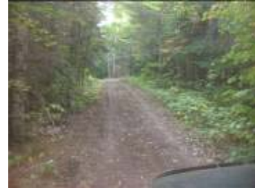
Above: portion of completed road. Side: 100's of boulders were removed from trail surface.