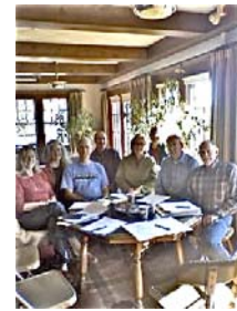
Norpine Board+Trail Admin

bers also crafted legal agreements with our trail administrator, contributed time in obtaining our 501(c)(3) status on our first attempt, and have actively taken a role in applying for grants for equipment and trail maintenance. Please consider joining us in preserving and maintaining this precious asset. Membership information and registration can be found on our website at www.norpinetrails.org